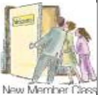
New Member Class

The next new member class will be held on Wednesday, June 8th. We meet from 7-9 pm in AldersGate. All those interested in joining Leesburg UMC, as well as current members, are invited to attend. Topics include: Basic Christian Beliefs, Our United Methodist Heritage, History and Structure, The Meaning of Membership, and more. Get to know others who are new to LUMC while learning how to get better connected. Thanks!