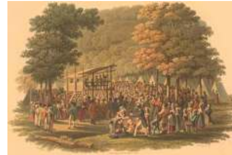
Methodist Camp Meeting, March 1, 1819

In the spirit and tradition of the Methodist Camp Meeting, July and August are "Camp Meeting Months". Our worship is less formal and we are singing many of our old favorites at 8:15 and 11 (and one or two at 9:45 as well!). Dress is casual - just remember to bring your Bible. Pray for God's blessing on our time together, and be prepared to sing and worship the Lord!