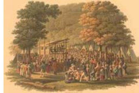
Methodist Camp Meeting, March 1, 1819

In the spirit and tradition of the Methodist Camp Meeting, July and August are "Camp Meeting Months". Our worship is less formal and we are singing many of our old favorites at 8:15 and 11 (and one or two at 9:45 as well!). Dress is casual - just remember to bring your Bible. Pray for God's blessing on our time together, and be prepared to sing and worship the Lord!