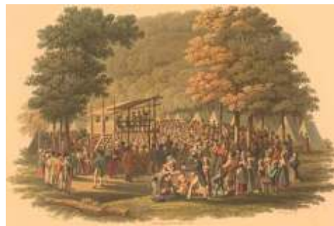
Methodist Camp Meeting, March 1, 1819

In the spirit and tradition of the Methodist Camp Meeting, July and August are "Camp Meeting Months". Our worship is less formal and we are singing many of our old favorites at 8:15 and 11 (and one or two at 9:45 as well!). Dress is casual - just remember to bring your Bible. Pray for God's blessing on our time together, and be prepared to sing and worship the Lord!