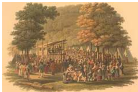
Methodist Camp Meeting, March 1, 1819

In the spirit and tradition of the Methodist Camp Meeting, July and August are "Camp Meeting Months". Our worship is less formal and we are singing many of our old favorites at 8:15 and 11 (and one or two at 9:45 as well!). Dress is casual - just remember to bring your Bible. Pray for God's blessing on our time together, and be prepared to sing and worship the Lord!