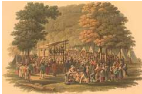
Methodist Camp Meeting, March 1, 1819

In the spirit and tradition of the Methodist Camp Meeting, July and August are "Camp Meeting Months". Our worship is less formal and we are singing many of our old favorites at 8:15 and 11 (and one or two at 9:45 as well!). Dress is casual - just remember to bring your Bible. Pray for God's blessing on our time together, and be prepared to sing and worship the Lord!