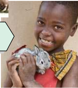
Trio of Rabbits, $60