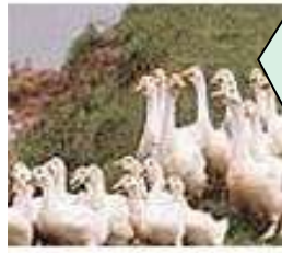
Flock of Geese, $20