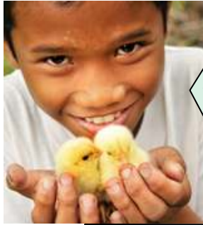
Flock of Chickens, $20

Please note: you cannot gift the tax deduction.