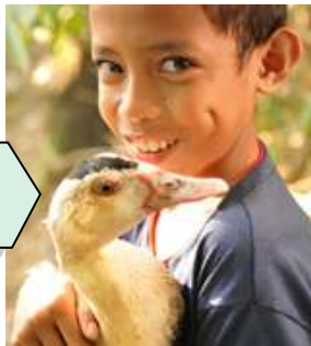
Flock of Ducks, $20