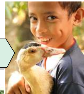
Flock of Ducks, $20