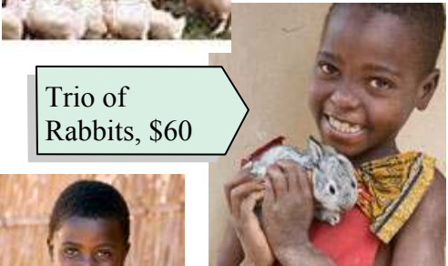
Trio of Rabbits, $60