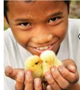
Flock of Chickens, $20