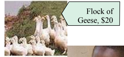
Flock of Geese, $20

Please note: you cannot gift the tax deduction.