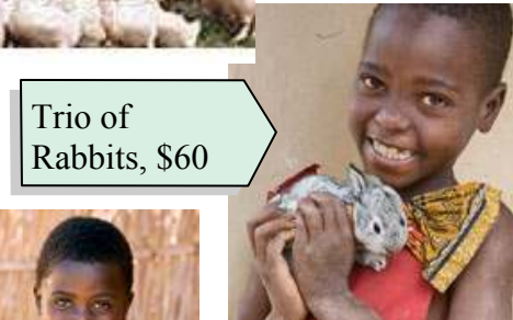
Trio of Rabbits, $60