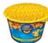
Individual servings of Mac and Cheese.