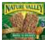
Individual servings of granola bars.