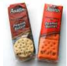
Individual servings of crackers, peanut butter or cheese.