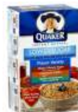
Individual servings of Instant Oatmeal.