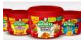
Individual servings of Chef Boyardee.