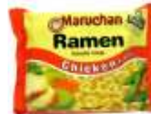
Individual servings of Ramen Noodles.