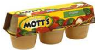
Individual servings of applesauce.