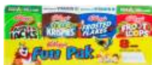
Individual servings of boxes of cereal.